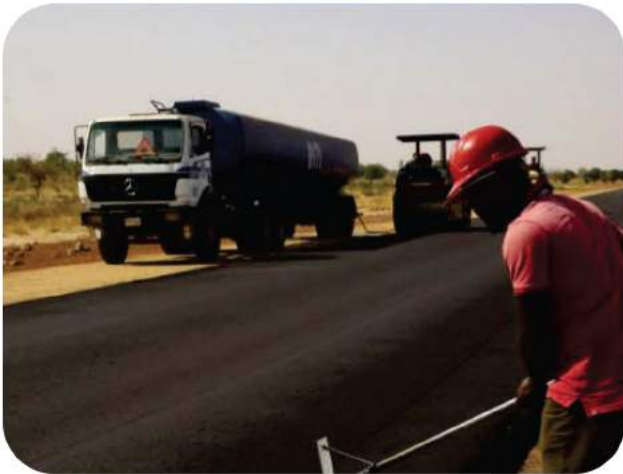
Road Construction Works Ghana