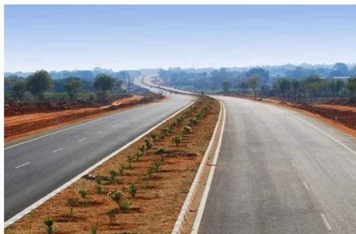
Development and Asphaltting of 50 km of road in the Circles of BAFOULABE, KITA and KENIEBA MALI