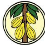
Ghana Cocoa Board Poised to Maintain Premium Quality Cocoa