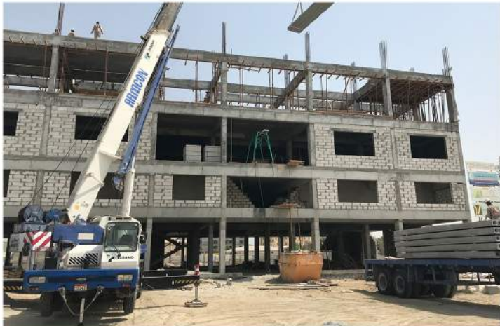
Construction of health infrastructure projects priorities of the Government - Agenda 111_ Manso Adubia GHANA