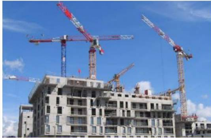
Construction works of an administrative building R+4 MALI