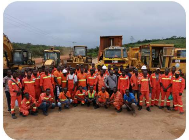
COPIAFAX Ghana team on a construction site in Ghana