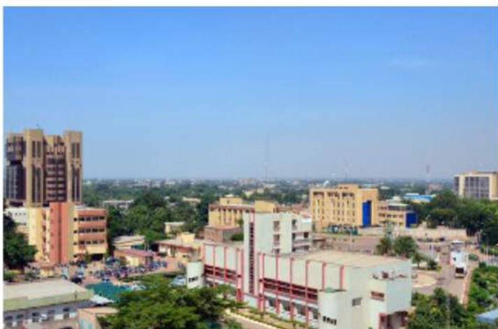
Construction of an Operations Center at Ouagadougou International Airport BURKINA FASO