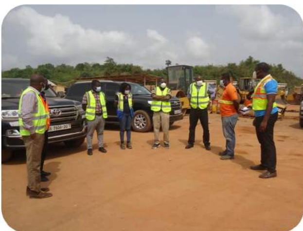
Our Supervisors at a Construction site in Ghana