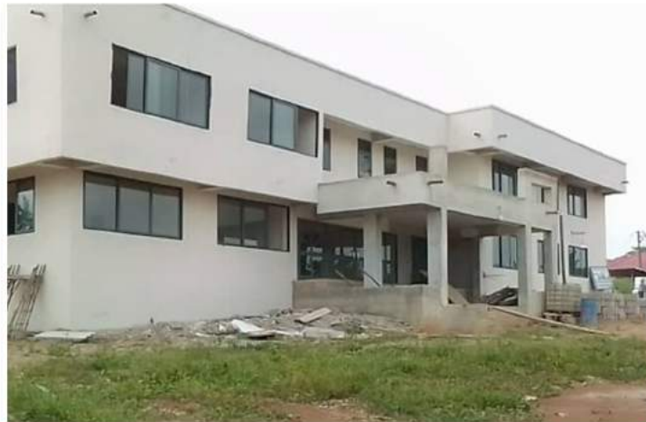
Construction and Completion of a 2-storey administrative block for the offices of the Department of Decentralization GHANA