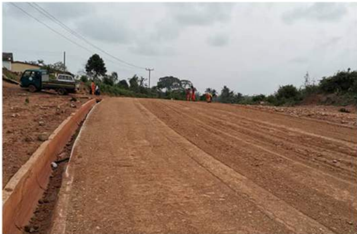
Paving of the ASSUOM – LARBIKROM road, 15.20km long GHANA