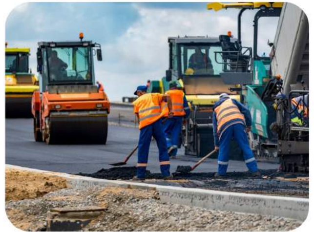
Road Construction Works Ghana