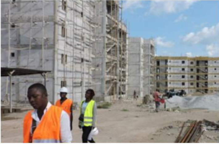
Construction and Drinking water supply of 950 F4-type housing units CÔTE D'IVOIRE