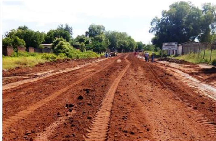
Rehabilitation of 8km AKONTOBRA-ALIKRA Feeder Road GHANA