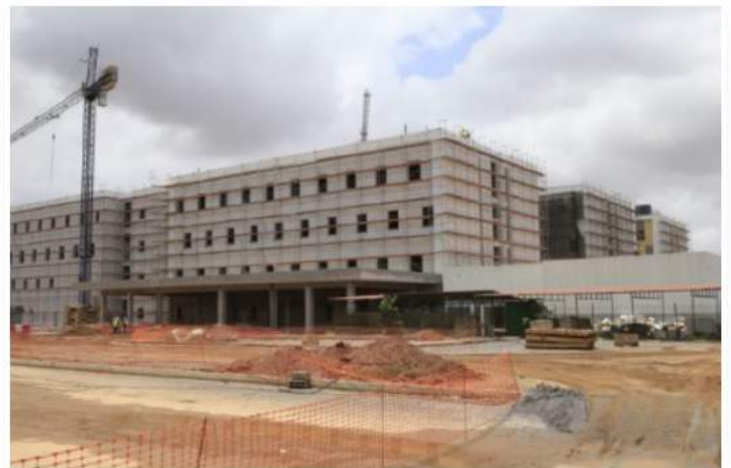
Construction of a Hospital Regional Capacity 300 beds BURKINA FASO