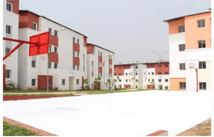
Construction and Drinking water supply of 950 F4-type housing units SENEGAL