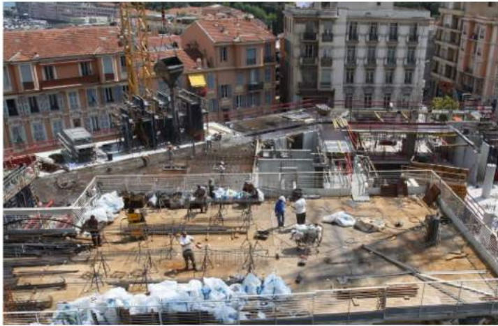
Building 10 Technical High Schools CÔTE D'IVOIRE