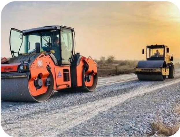
Road Construction Works Ghana